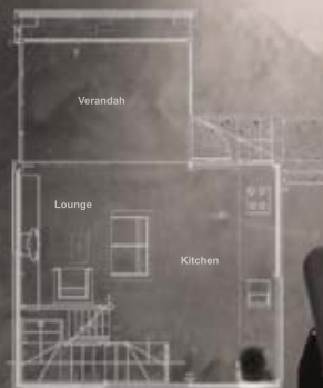
Plan - Upper